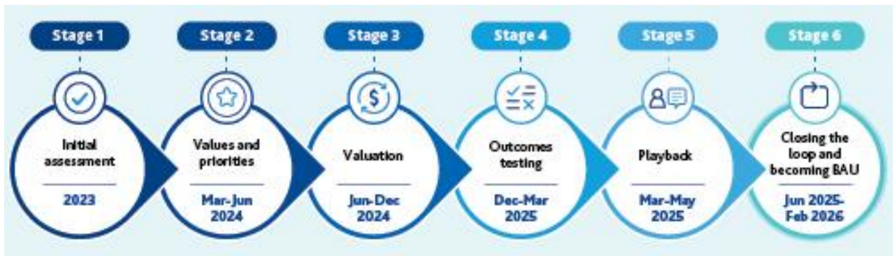
Figure 1: Melbourne Water's engagement journey

Our engagement process was tailored and targeted to our distinct stakeholder groups. We collected information on community and customer expectations through surveys and assisted with prioritisation and plans via a highly collaborative process involving deliberative forums with key representatives and customer groups. This process built a shared understanding of our performance, the key challenges to meet over coming decades, and the Outcomes our community and customers want us to prioritise. We also engaged on how best to balance competing priorities and associated costs.